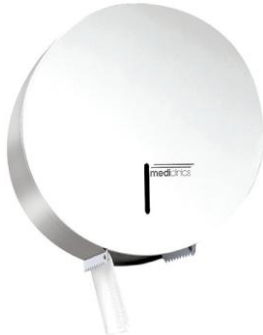
PR0783 white epoxy finish