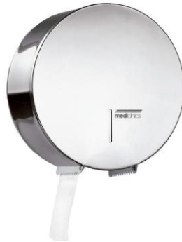
PR0783C bright finish