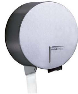
PR0783CS satin finish